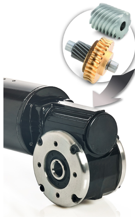
Bodine type 33A-5L/H hollow shaft right angle gearmotor with worm gearing

Bodine engineers identified four key aspects of gearmotor design that contribute to quiet operation, and helped the OEM manufacturer select the best gearmotor solution for their machine.