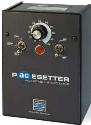
MODEL 2998 NEMA-1 / IP-40 SERIES AC MOTOR SPEED CONTROL

V/Hz inverters (basic) — this is the most basic type of drive. V/Hz drives use a pulse-width-modulation scheme to create an output roughly approximating a sine wave of variable frequency, with its amplitude, or voltage, proportional to set frequency. The speed range on V/Hz drives is limited and torque is not easily controlled.