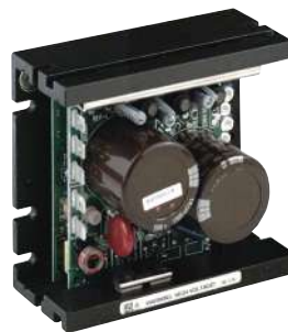
CHASSIS / IP-00 SERIES AC INVERTER SPEED CONTROL

We offer three enclosure types with our AC speed controls. The AC stock controls require minimal set-up and no programming. Most Bodine inverter-duty gearmotor customers use our gearmotors in open-loop velocity control applications, like conveyors, feeders, metering pumps. We also offer custom OEM solutions where we install encoders and other feedback devices to our inverter-duty gearmotors and motors.