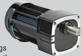
TYPE 42R-FX INVERTER-DUTY GEARMOTOR

There are many parameters that can be changed in the AC speed control that also affect motor performance and temperature. One example is the Torque Boost setting. At lower speed/frequency settings an inverter-duty gearmotor may not be able to produce the same torque that it can at a higher speed or frequency. The torque boost setting adjusts the output voltage at lower frequency to help the motor generate more torque at those lower speeds.