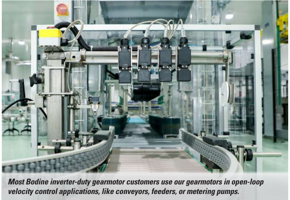
Most Bodine inverter-duty gearmotor customers use our gearmotors in open-loop velocity control applications, like conveyors, feeders, or metering pumps.

By converting the incoming 60Hz AC power to a DC voltage, inverter drives (also called variable frequency drives) allow AC motors to run at variable speeds, and reduce the inrush of current when the motor starts to rotate. The DC voltage is “chopped” by power transistors (IGBTs) at high frequencies to simulate a sine wave that is then sent to the motor. Varying the output voltage and frequency of the control changes the speed of the motor.