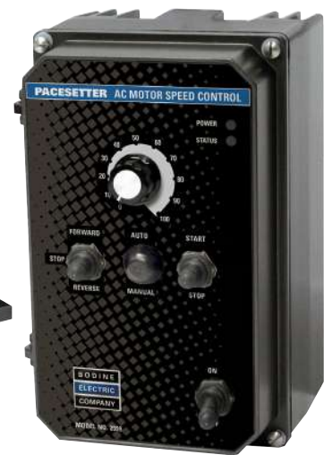
MODEL 2999 NEMA-4X / IP-65 SERIES AC MOTOR SPEED CONTROL