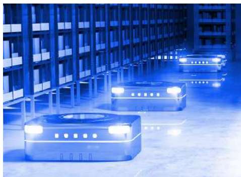
Automated Guided Vehicle/Factory Automation

Large distribution warehouses have turned to Automated Guided Vehicles (AGVs) to keep up with ever-increasing demand for faster and more economical deliveries. An original equipment manufacturer (OEM) for AGVs contacted Bodine Electric Company to help with the development of two new custom gearmotors.