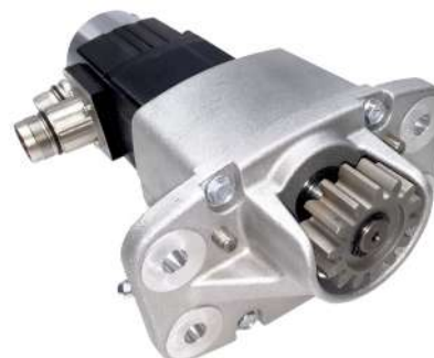
Custom Bodine type 22B-Z parallel shaft gearmotor