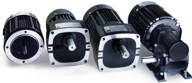
Fractional horsepower motor and gearmotors (<746 Watts)

Buyers should first decide what kind of operating life is needed. If durability is not an issue, or if the duty is so intermittent that even a short-life, ("throw-away") motor will translate into years of operation, then you'll want to go with the best price.