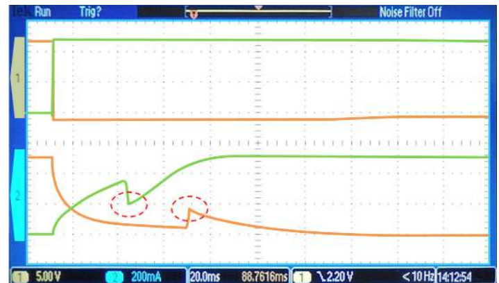
Figure 2 Orange: transition to power-off state Green: transition to power-on state

Brakes are designed to operate continuously without overheating in the static holding position. Designs that include both dynamic and static braking require brakes with intermittent ratings. The duty cycle (braking and stop cycle) determines this rating.