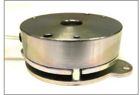
Typical holding brake

During early operation of static brakes, the actual torque rating increases as the unit is subjected to burnishing. A typical 15 lb-in rated static brake can easily achieve 18 lb-in after normal operation and burnishing. The manufacturer usually designs the brake with higher torque capability to maintain the published rating for the life of the unit.