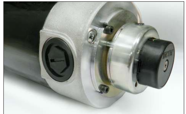
Bodine PMDC gearmotor with brake and encoder installed (using the high-speed [accessory] shaft of the motor).

Holding, or “Power-Off,” brakes provide extra safety in applications where the load must remain in position in the event of power loss or equipment failure. Our design engineers have helped OEMs develop brake systems for hundreds of AC and DC applications, from home stairlifts to industrial applications. This Application Note will focus on the principles of operation for the most common type of electromagnetic brake, the power-off design. For more information on clutches and braking techniques, see Chapter 10 in the Bodine Handbook .